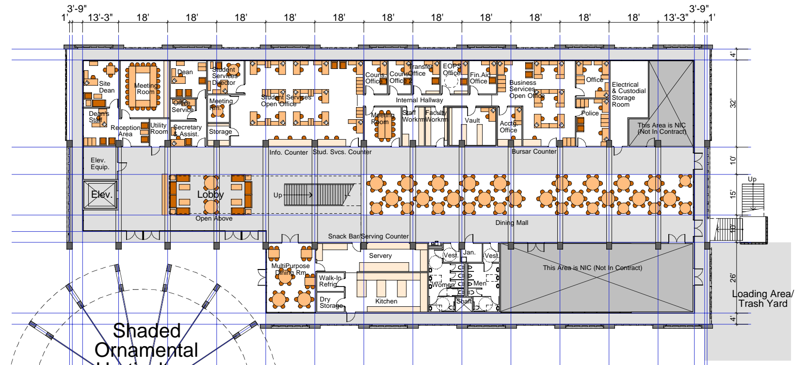
1st Floor -- Staff, Administration & Student Services, Dining Mall, Multipurpose Dining Room, Kitchen/Snack Bar